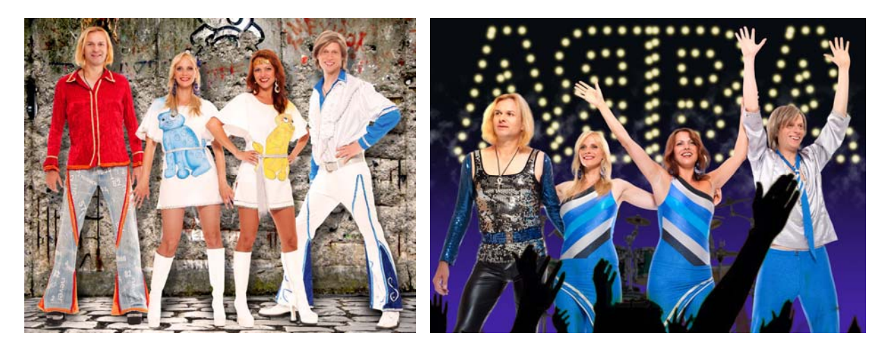
Seite 5 von 6 – Info-Sheet english THE REAL ABBA tribute - www.THE-REAL-ABBA.com – V_05 / 2013

120 minutes net in 1 or 2 sets (break rd. 20 min.) – details can be arranged